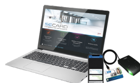
SECARD SECARD configuration kit and SSCP®, SSCP2 & OSDP™ protocols